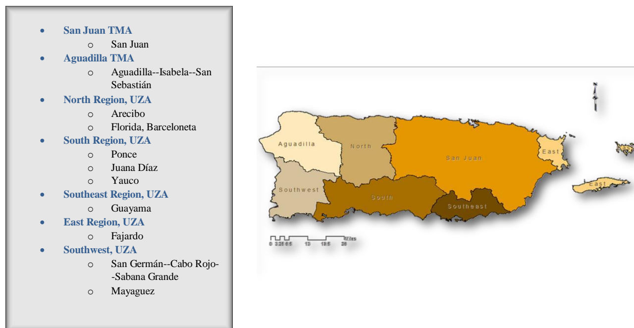
Figure1. Transportation Planning Regions (TPRs)

This Strategic Planning Research Program consolidated tasks 616, 617, 618, 619, and 634 into task 622 as Urbanized Areas (less than 200,000 inhabitants) or UZAs. Task 614 continues as San Juan Transportation Management Area, and Task 615 as Aguadilla Transportation Management Area. Moreover, it adds a new project as Puerto Rico Freight Strategic Plan.