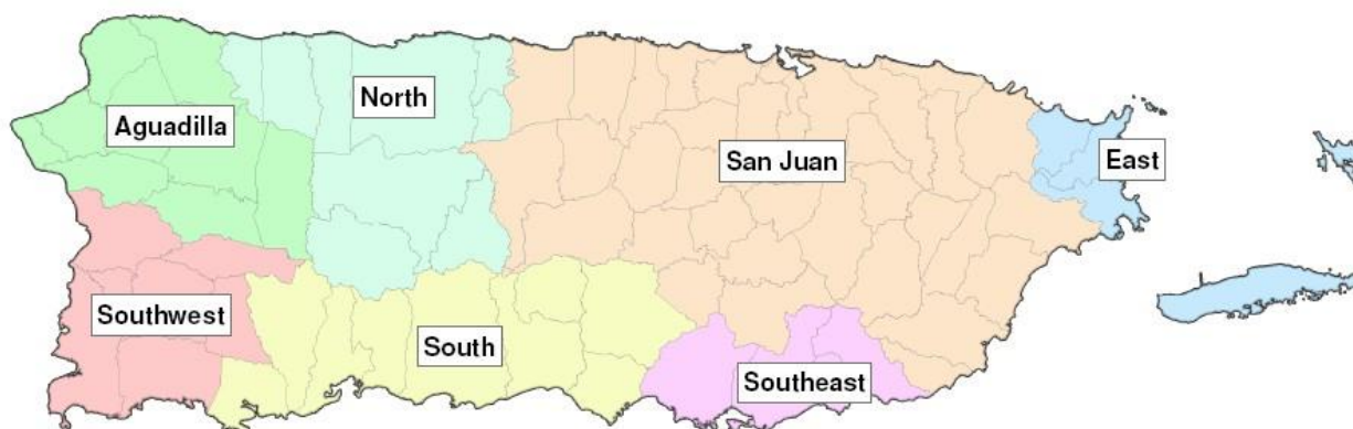
Figure 3: Transportation Metropolitan Areas and Transportation Planning Regions