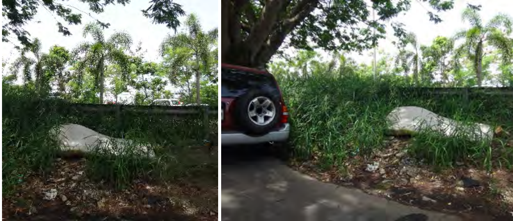
Looking south-west from the marginal road at a mattress, debris & waste alongside the “green” strip.