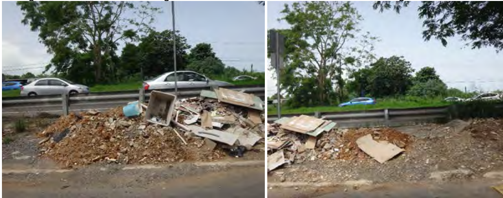
Looking south-west from the marginal road at construction debris & waste alongside the median strip.