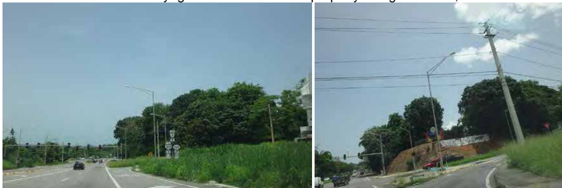
Looking north-west on the north-bound lanes of PR-2 at the intersection with PR-104 & PR-3108 at the start of the Mayaguez Resort & Casino property alongside PR-2, Km. 152.9.